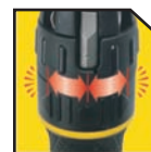
3 Way Audible Ratchet

Bit storage system for easy visibility, access & security Magnetic bit holder for quick, secure change-over of bits Top quality, three position audible ratcheting mechanism forward, reverse Supplied with 10 bits to suit a wide variety of purpose Overall 254mm/10