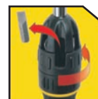
Patented Bit Storage