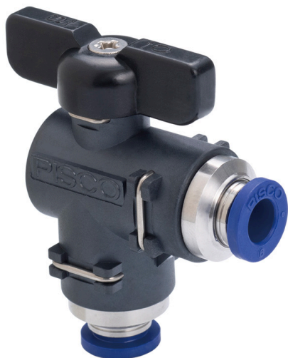
The image is of BVLG20-0608SUS