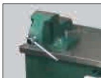
Optional with 70841 heavy duty square steel bench vice 4" (to be purchased separately)