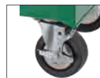
Two 5" swivel (with stopper) and two 5" fixed casters with pin rolling bearings