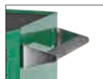
Trolley handle with PVC cover