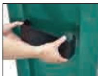
Removable storage box provided for tool trolley