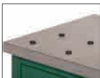
Mounting hole reserved for bench vice