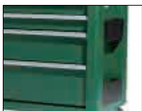
Both sides of the tool trolley provided with storage boxes for convenient storage of can-like workpieces