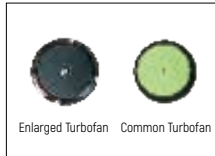
Large turbofan for stable output air volume and low noise