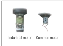
Customized industrial motors adopted for continuous operation of production line