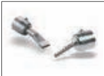
2 nozzles provided for free (Spreader Nozzle of 20MM, standard round nozzle of 5MM)