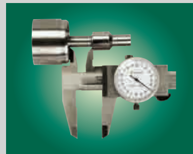
Inner diameter measurement