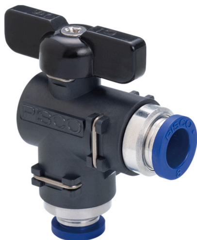
The image is of BVLU20-0808SUS