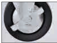
5" heavy duty casters for durability