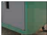
Cabinet door with integrated hinge