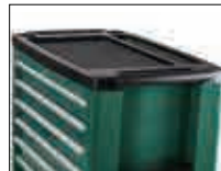
Four columns of tool trolley with circular arc design for higher impact resistance