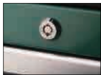
Round socket lock