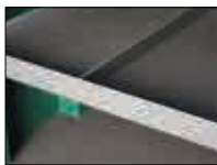
Drawer liners on all boards (EVA foam)