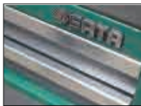
Thickened bright aluminum alloy handle for elegance