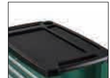
Integrated table top with parts tray for storing small items; Integrated handle for comfort