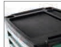
Integrated table top with screwdriver slot