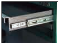
45mm ball slide for higher load capacity