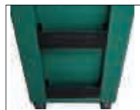
Both sides of the tool trolley provided with storage boxes for convenient storage of can-like workpieces