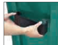
Removable stowage box provided for tool trolley