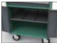
Partition board included inside