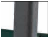
4 column protective covers for effectively preventing collision between the tool trolley, vehicles, machine tools and other equipment