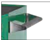
Trolley handle with PVC cover