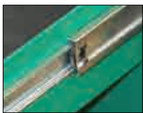
High-strength guide rail for smoothness and long service life