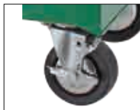
Two 5" swivel (with stopper) and two 5" fixed casters with pin rolling bearings