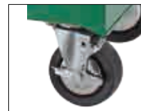
Two 5" swivel (with stopper) and two 5" fixed casters with pin rolling bearings