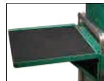
Foldable workbench for easy operation