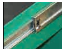
High-strength guide rail for smoothness and long service life