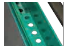
Tool jack for inserting pry bar, torsion wrench and other long tools