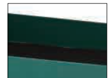
Bottom tray for storing large tools