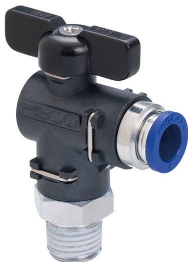
The image is of BVLC20-0802SUS